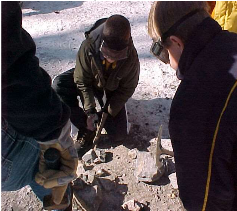
Collecting Rock Samples